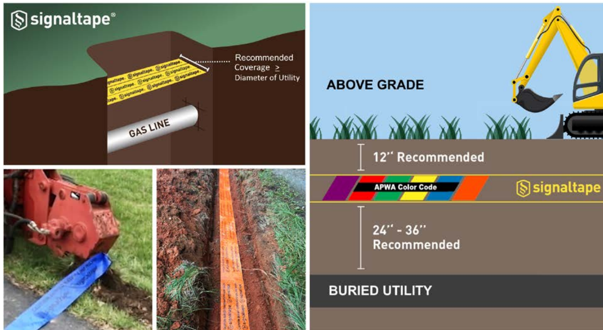
Figure 1 - Signaltape Installation

Each run of Signaltape must be overlapped by a minimum of 20 ft (6 m) or must be joined as shown below where possible. Signaltape may also be installed with static or vibratory plow.